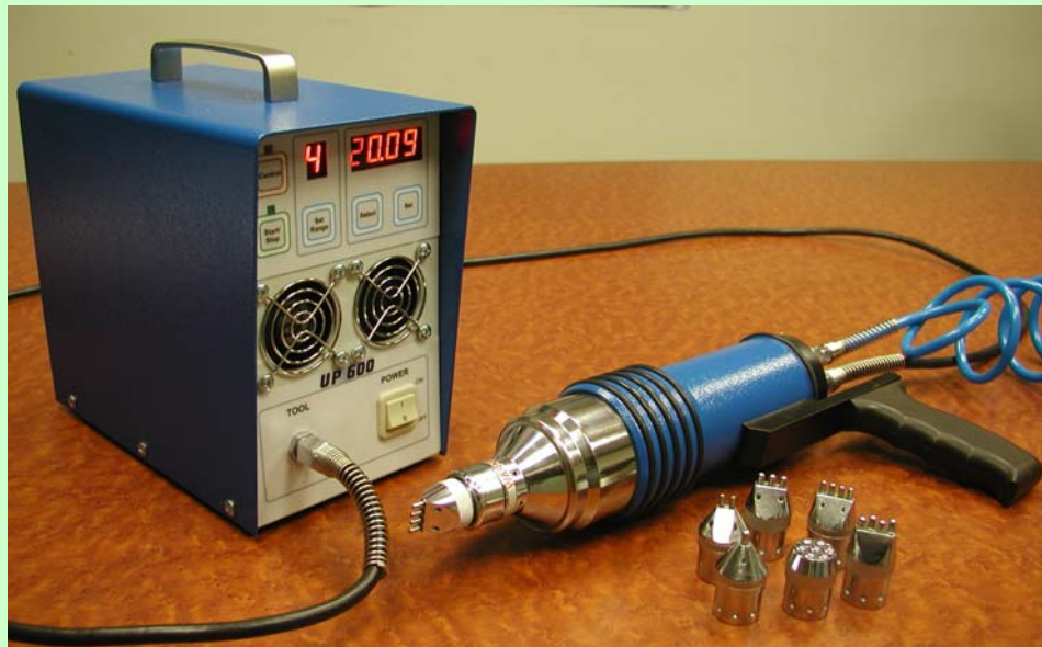
Basic UP system for fatigue life improvement of parts and welded elements

One of the promising directions in using of the HPU for industrial applications is the Ultrasonic Impact Treatment (UIT) of parts and welded elements. In most industrial applications the UIT is known as Ultrasonic Peening (UP). The UIT/UP produces a number of beneficial effects in metals and alloys. Foremost among these is increasing the resistance of materials to surface-related failures, such as fatigue, fretting fatigue, stress corrosion cracking and wear.