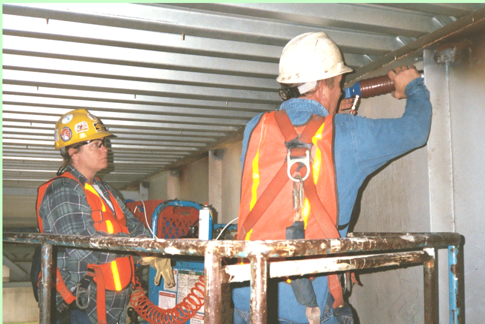
Ultrasonic Peening of welded elements of a highway bridge

areas/industries where the UP was applied successfully include: Railway and Highway Bridges, Mining, Construction Equipment, Shipbuilding, Automotive and Aerospace.