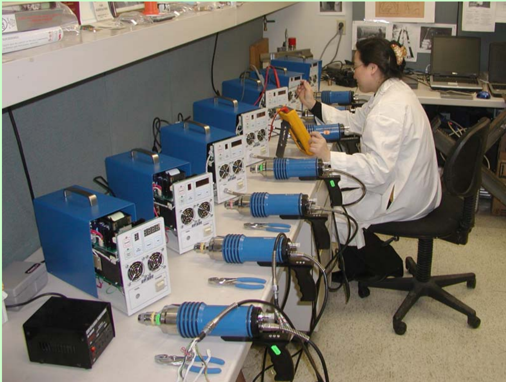
Final Assembly and Tuning of UP Systems at SINTEC

Y. Kudryavtsev and J. Kleiman. Fatigue of Welded Elements: Residual Stresses and Improvement Treatments. Proceedings of the IIW International Conference on Welding & Materials . July 1-8, 2007, Dubrovnik, Croatia. P. 255-264.